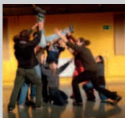
© Escola de Cultura de Pau