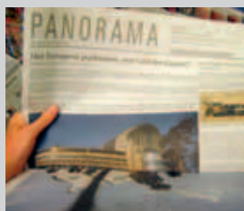
© Sven Augustijnen, Panorama, 2005, Newspaper supplement, 8 pages, black and white, colour